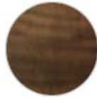
A1 - WALNUT WITHOUT KNOTS