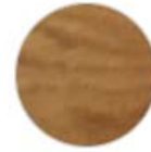
A2 - OAK WITHOUT KNOTS