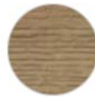
A3 - OAK WITHOUT KNOTS FINISH VINTAGE