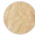
A3 - OAK WITHOUT KNOTS FINISH WHITENED