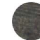
A4 - OAK WITHOUT KNOTS PIGMENTED ASH GREY