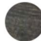
A4 - OAK WITH KNOTS PIGMENTED ASH GREY