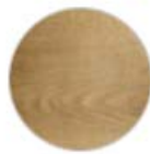
A3 - OAK WITH KNOTS FINISH NEUTRO