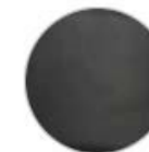
A4 - OAK WITH KNOTS PIGMENTED TOTAL BLACK