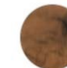
A5 - OAK WITH KNOTS TABACC