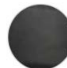
A4 - OAK WITHOUT KNOTS PIGMENTED TOTAL BLACK