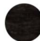
A5 - OAK WITH KNOTS VULCANO