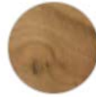
A2 - OAK WITH KNOTS