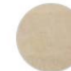
A4 - OAK WITH KNOTS PIGMENTED WHITE MILK