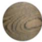
A3 - OAK WITHOUT KNOTS FINISH MYSTIC BLACK