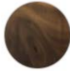
A1 - WALNUT WITH KNOTS