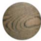
A3 - OAK WITH KNOTS FINISH MYSTIC BLACK