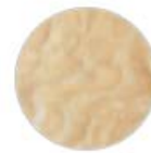
A3 - OAK WITH KNOTS FINISH WHITENED